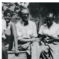
Le Corbusier, Jeanneret, Perriand

In 1922, Le Corbusier began working in the new rue de Sèvres, Paris, atelier with his cousin Pierre Jeanneret with whom he shared research projects and design criteria in a profound and life-long professional relationship.